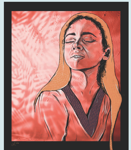
by Lisle Gwynn Garrity © a sanctified art